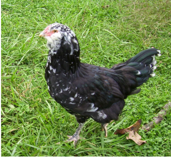
"The Eagle" Juvenile Plumage