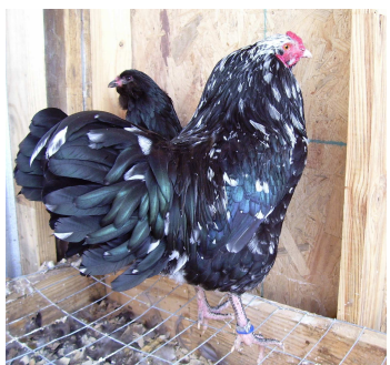
"Domino" Adult Plumage