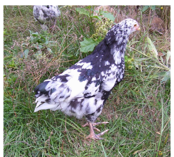
"Domino" Juvenile Plumage