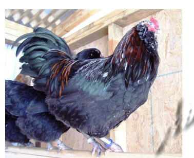
"The Eagle" Adult Plumage