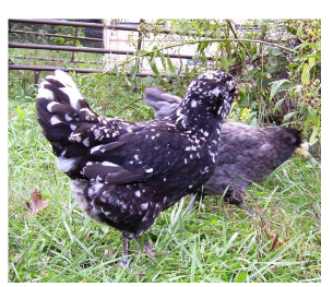
Mottled Ameraucana Hen

The bird to head the breeding pen should be a first class exhibition cock or cockerel, or one as near to the Standard as possible. In selecting the mates for such a bird, one can use hens or pullets that are up to exhibition form and so have the appearance of being standard birds, and some that are on the dark side. One should avoid the use of hens or pullets that carry too much white, especially on the wings and tail, because the tendency is for the birds to throw progeny lighter than themselves. Characteristics to be avoided are solid white feathers and inhibited shanks and eyes.