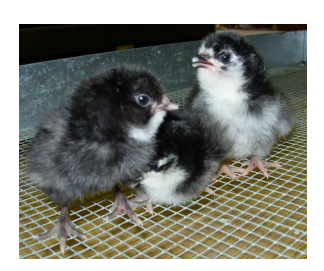
Brown Red Ameraucana Chicks